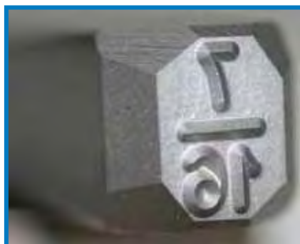
Example of Tier Style